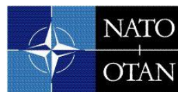
NATO-Georgia Professional Development Programme