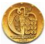
Tbilisi City Hall